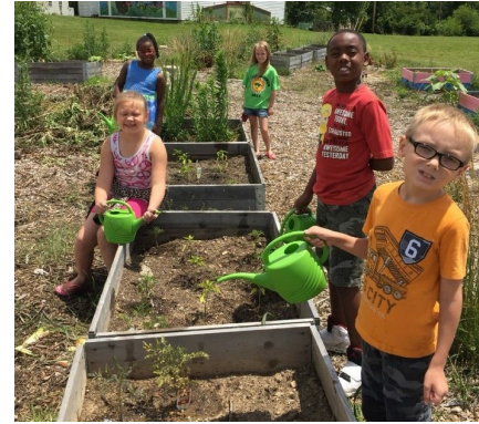
Children learn about promoting food access at Springfield Promise Grows