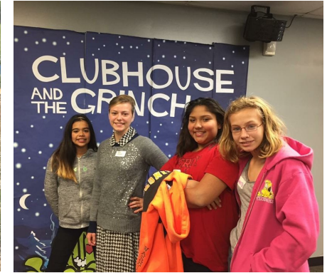
"Teens in Training" learn leadership skills & build bonds between neighborhoods